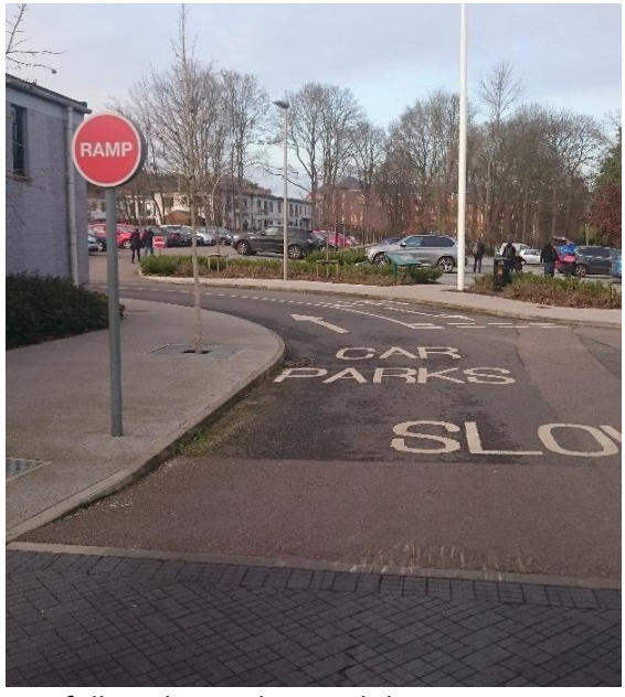
You follow the road around the corner

A member of the Bletchley Park Trust staff will greet you. If you tell them you are visiting The National Museum of Computing, they will direct you up the hill to the right area.