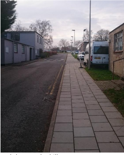
and then up the hill